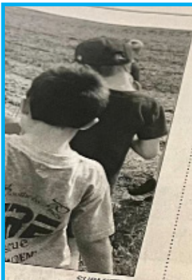
SUBMITTED Children to explain tong vegetables.